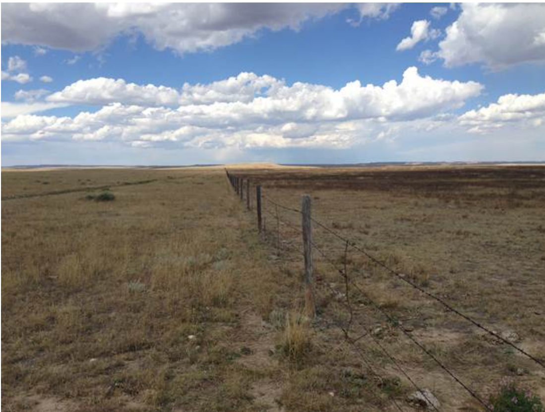
Stiff Greenthread (Brown) domination in pasture 23W (right of fence) in September 2014.

On behalf of the USDA-ARS-Rangeland Resources Research Unit, I thank you all for your continued participation in this project.