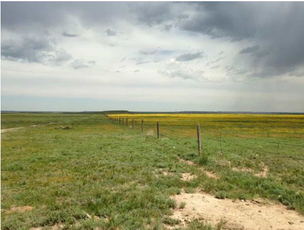
Stiff Greenthread (Yellow) domination in pasture 23W (right of fence) in June 2014.